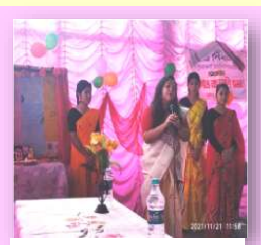
Freshmen Social at Dhakuakhana College Girls Hostel