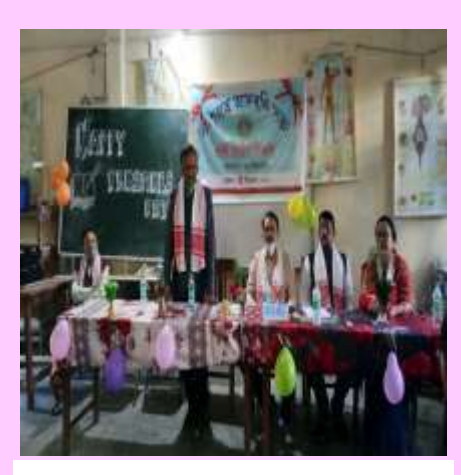
Freshmen Social, Department of Zoology