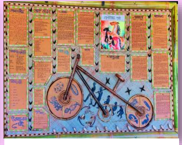
PRANIBIGYAN BARTA, Zoology