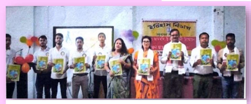
Inauguration of Maharshi , E-magazine, Dept of History