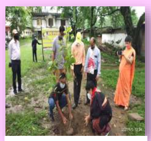
World Environment Day