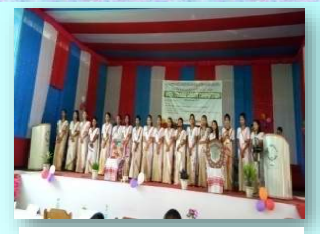
Inaguration Ceremony of Debate Competition