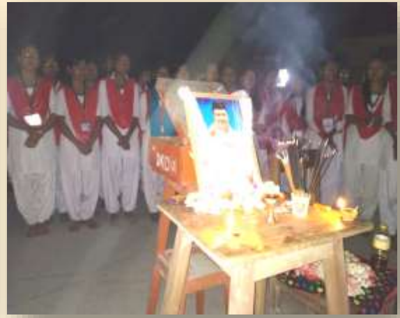
Birth Anniversary of Dr. Bhupen Hazarika