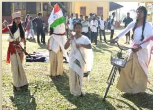
Go as You Like Competition