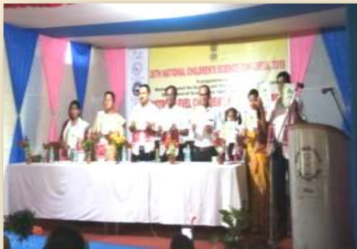
Photographs of National Science Congress

Assam Science Technology and Environmental Council initiative the 26 th district National Science Child Congress was organized at Dhakuakhana College from 29 th September 2018. More than two hundred (200) child scientists between the age group of ten to seventeen years participated in the event. The main theme of the 26 th district National Child Science Congress was, 'The importance of science, technology and innovation for a clean, green and healthy nation'. The child scientists presented various innovative projects on the said theme.