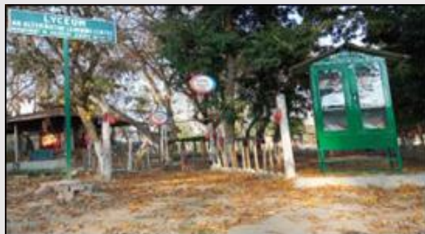
Scenic beauty of Lyceum