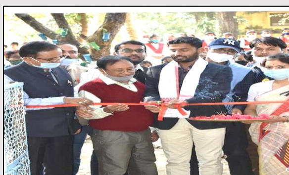
Inauguration of Lyceum

Institutional distinctiveness of Dhakuakhana College is pervasive in the domain of Alternative Learning . This aspect of learning ambience is reflective in the endeavor named Lyceum: An Alternative Learning Centre . Originating from the Ancient Greek idea and is later seen as a category of educational institution defined within the education system in Europe, 'LYCEUM', is a platform providing an Alternative Learning Centre for the students of Dhakuakhana College. An initiative undertaken by the Department of Political Science, LYCEUM is objectified to think and promote students beyond academics. An arena of lively discussion and debates beyond concretes, this Alternative Learning Centre started on the commemorative occasion of the International Human Rights Day on 10 th December, 2020. It was complemented by the performance of a street play which was followed by a lively discussion by eminent personalities.