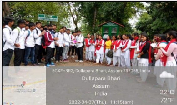
Applauding Students Achievement