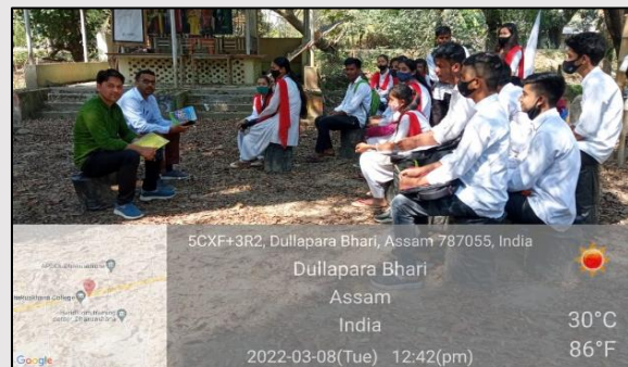
Snaps of Group Discussion at Lyceum