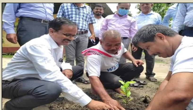
Forest Man of India planting a sample in the campus

The College encourages students and teaching staff to contribute to a green future. The College focuses on promotion of recycling and reusing practices and sustainable environmental management. Energy audit is conducted to reduce power consumption and deploy alternate energy sources. The college observed its foundation day on 26 th July, 2022 by inviting the “ Forest Man of India ” Mr. Jadav Payeng to create awareness about preservation of environment and ecosystem. The college has a “ Green Brigade ” to supervise the green initiatives.