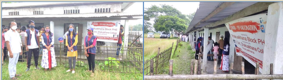
Health Related Awareness Program