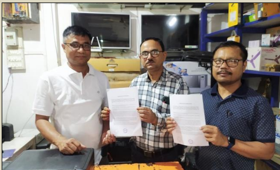
MOU with Praptipol Electronics for the disposal of E Waste