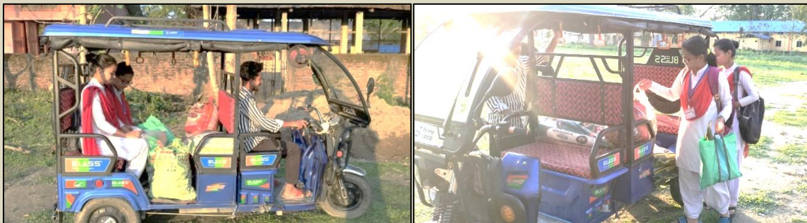
Use of Battery Rickshaw in the Campus