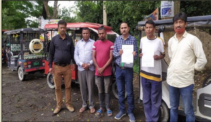
MOU with Battery Rickshaw Association