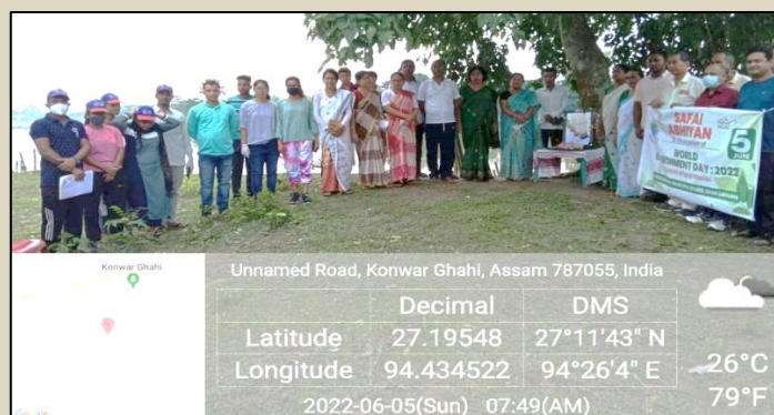
Celebration of World Environment Day