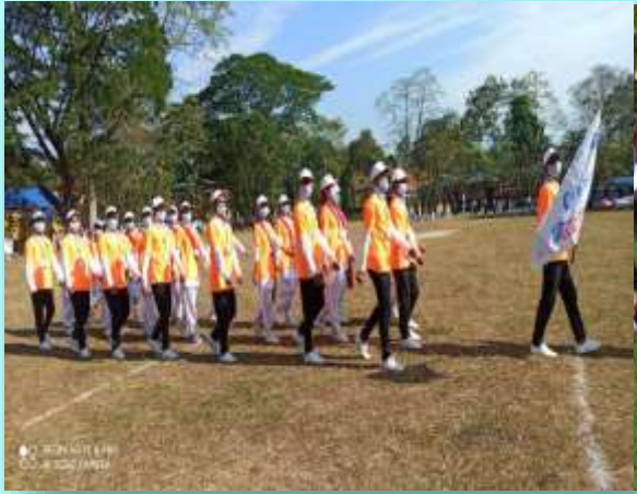
March past Competition