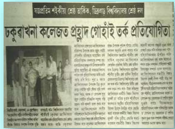
Newspaper Clipping of Debate