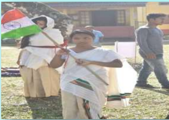
Go as You Like Competition