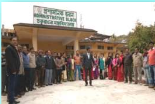
Photograph of Observation of Constitution Day