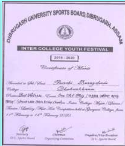
Best Actress, DU Youth Fest Purabi Buragohain