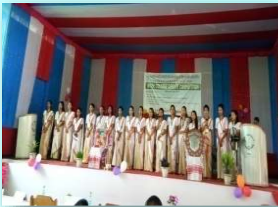
Inaguration Ceremony of Debate Competition